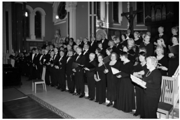
Bray Choral Society